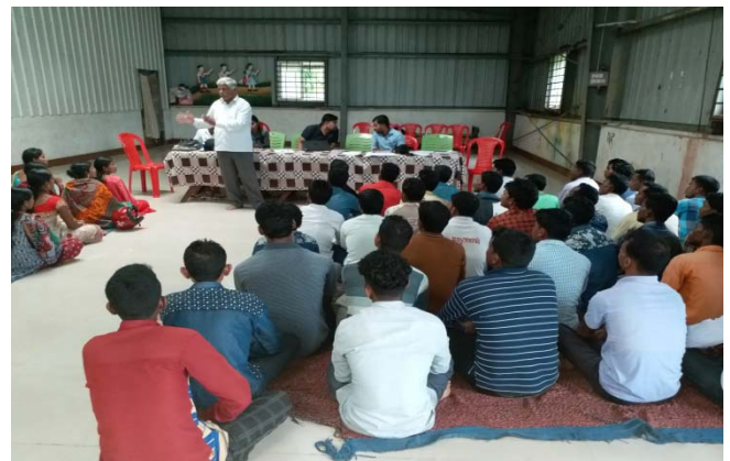
Sensitization cum screening meeting by Project team at district level to identify youth