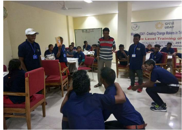
Exposure Visit to IED and Simulation Exercise in the State Level Training of Youth