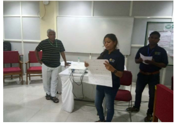
Orientation on reporting formats and Presentation by youth on social action projects