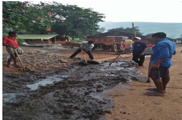
Community interface program by trained youth in their villages