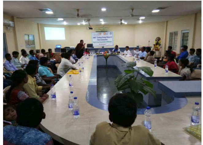
District Consultation with key stakeholders where official of district administration chaired the meeting