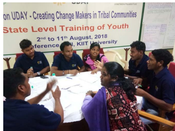
Module Development Workshop and Group work by Youth during State level Training of youth