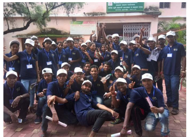
Simulation Exercise during a session and Exposure visit to OFMRDC