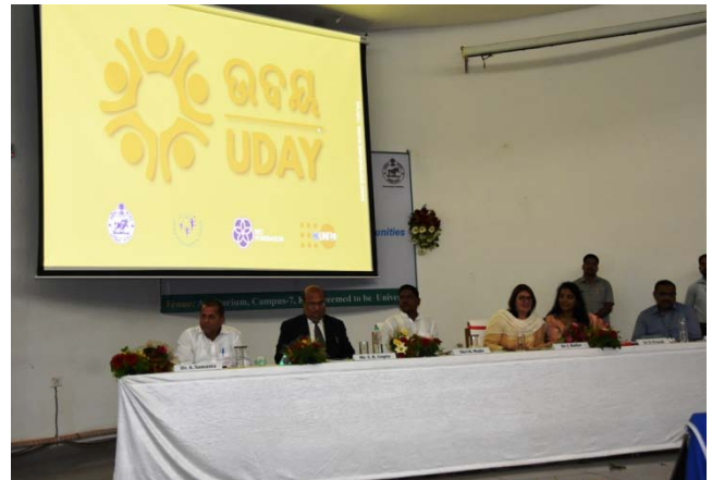
State level Project Launch event inaugurated by Honorable Minister, ST & SC Development, Government of Odisha and launch of UDAY logo